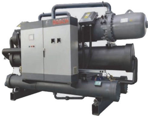
Commercial Heat Pump, Water-Sourced 螺桿水地源熱泵