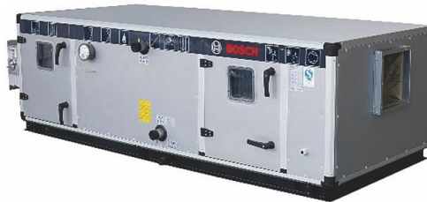
Modular Air Handling Unit 組合式空氣處理機組

Nominal output range 505~1,800 kW High efficiency with EER >6.3 Double-screw design, semi-hermetic scroll type compressor with high precision electronic expansion valve for wide throttling