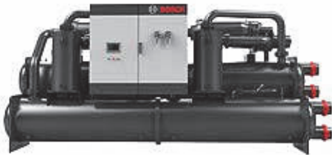
Commercial Chiller Water-Sourced 水冷螺桿冷水機組

Nominal output range 33 ~ 135 kW Modular design, up to 16 units one system max. output 1,072 kW For cooling and heating; or heating plus hot water generation