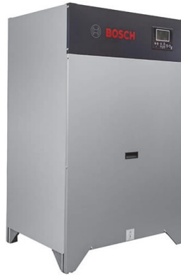
Domestic Heat Pump, Water-Sourced 水源熱泵渦旋冷水機組

Nominal output range 348~1,830 kW Water loop or ground water source For cooling and heating, plus hot water generation. Modulating range/ratio of up to 6.25-100%/ 1:16