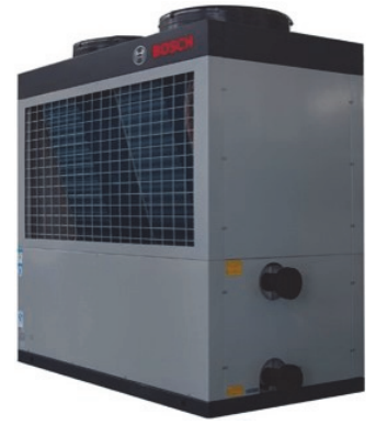
Domestic Heat Pump, Air-Sourced 風冷冷水機組-風冷模塊

Nominal output range 8 – 108 kW For cooling and heating; plus hot water generation High efficient scroll type compressor and coaxial heat exchanger